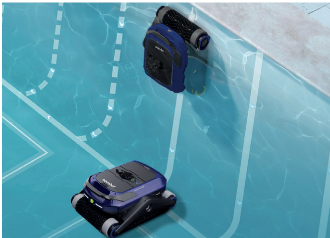
Wall & Waterline Cleaning

Aquabot's proprietary dual-ultrasonic radars provide 30% faster scanning and mapping, accurately detecting obstacles for efficient and seamless cleaning paths.