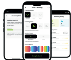
Industry-leading Connectivity and App