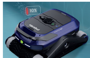
Self-Parking Capability when cleaning is complete or when battery level drops below 10%.