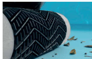
Extra-wide dynamic Brushes 10% wider than the previous generation.