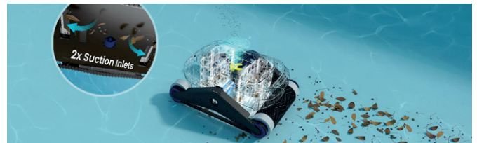
Turbo Mode Cleaning