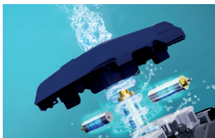
Super Suction Power